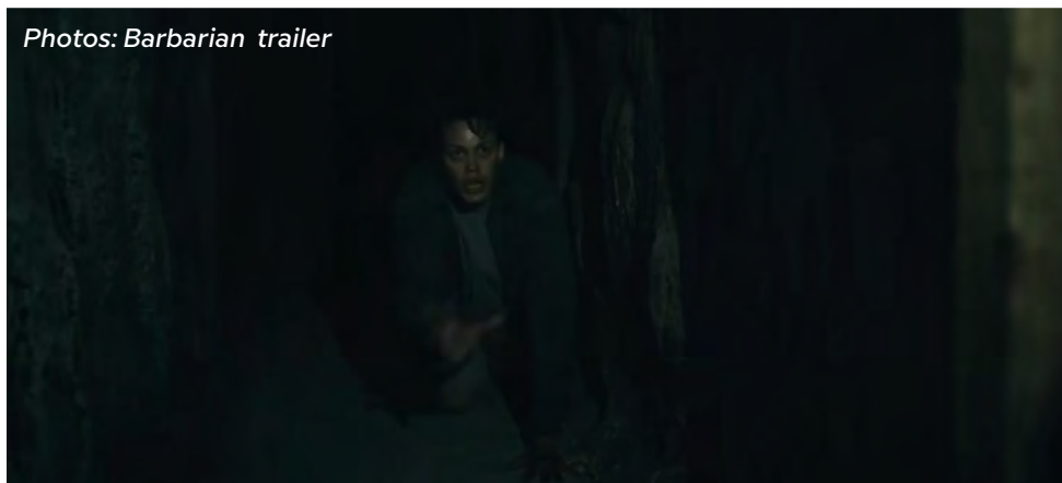
Photos: Barbarian trailer